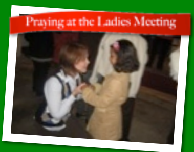
Praying at the Ladies Meeting