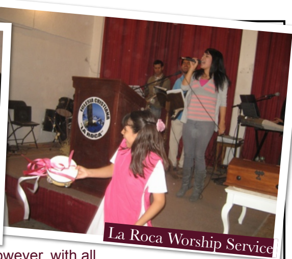
La Roca Worship Service

.....the bible school or the discipleship center; however, with all this accomplished, we are ready to continue to work to make these projects a reality!