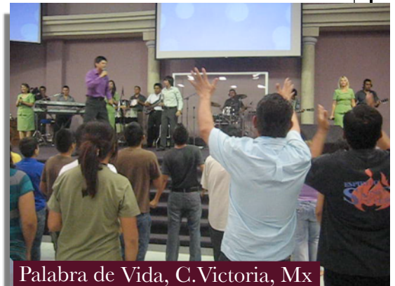
Palabra de Vida, C.Victoria, Mx