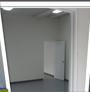
Grace discipleship center