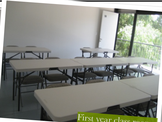
First year class room

.....contd. from pg. 1..... Grace discipleship center (Spanish: La Gracia Centro de Discipulado)! Beginning in September, we will be offering the free discipleship classes and Bible studies for all those who are interested. September 22 is the first day of classes for our Saturday Bible college. We are happy to announce that we already have a group of 5-10 people who are interested in coming from León which is 2 hours northwest of us! We also have people in other surrounding cities contacting us who are interested in these weekend classes. It is our desire to make CBC México accessible to as many people in Central México as possible. Our center will not only offer them a great CBC experience, but also the opportunity to establish new friendships with people from different churches and cities.