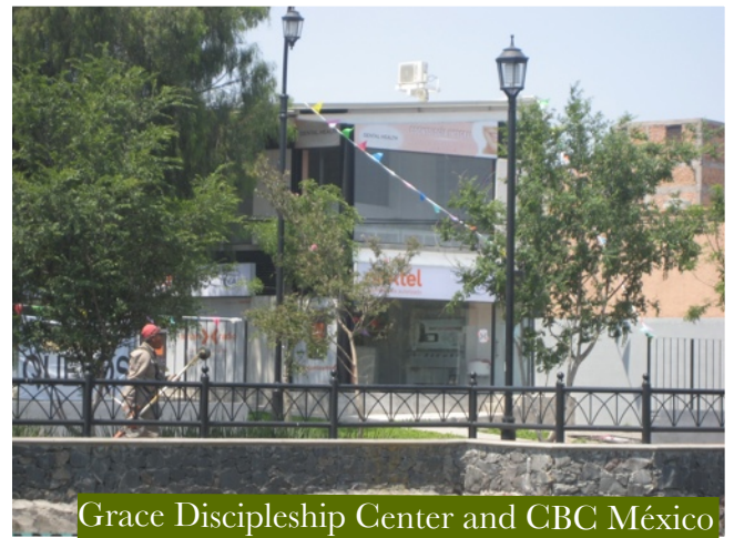
Grace Discipleship Center and CBC México