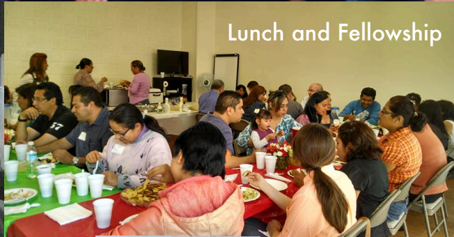
Lunch and Fellowship