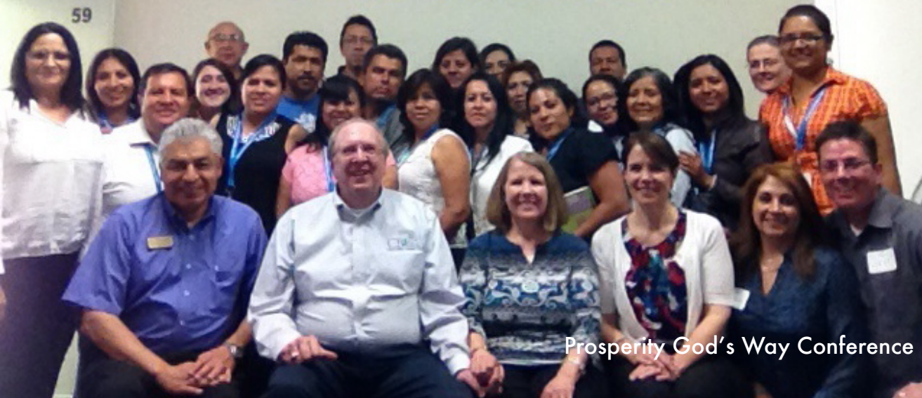
Prosperity God's Way Conference