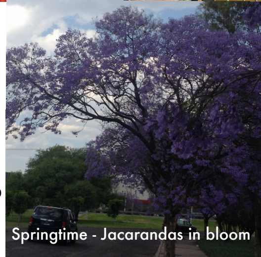
Springtime - Jacarandas in bloom