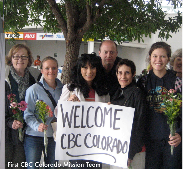
First CBC Colorado Mission Team