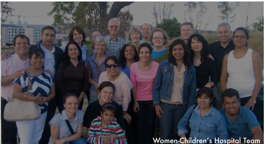
Women-Children's Hospital Team