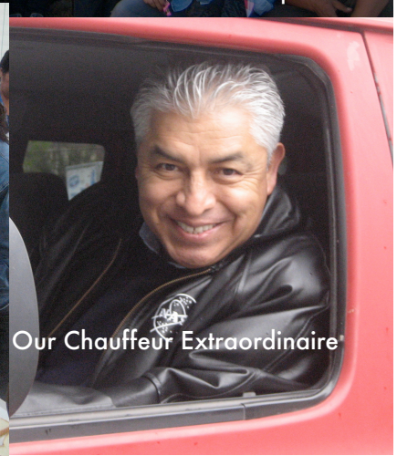
Our Chauffeur Extraordinaire

I would like to receive the monthly newsletter. (circle "email" or "address" and fill out the option below)