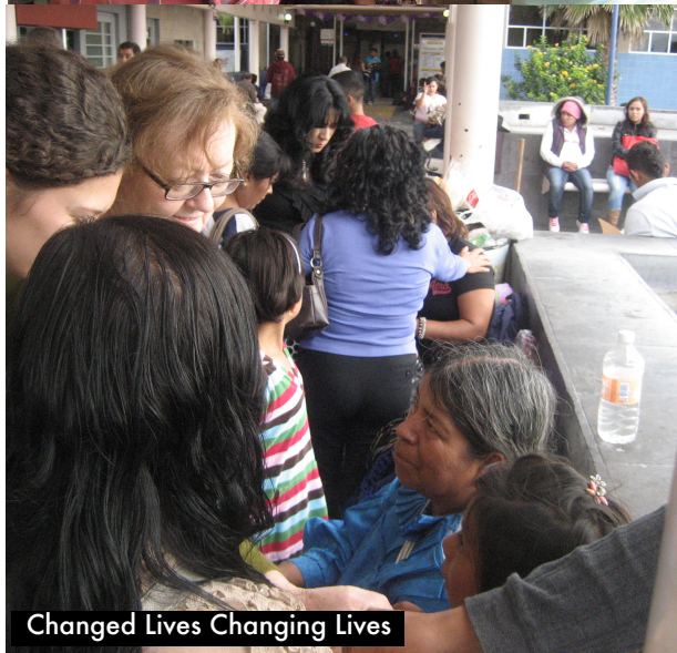
Changed Lives Changing Lives