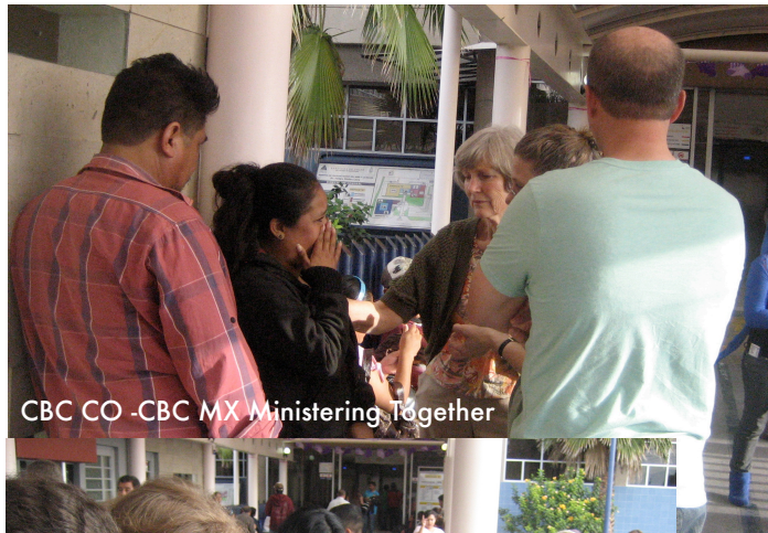
CBC CO - CBC MX Ministering Together